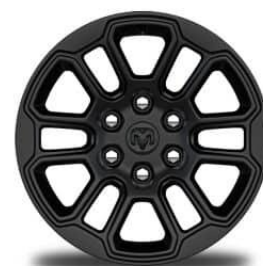
18x8.0-inch Painted Mid-Gloss Black Wheels